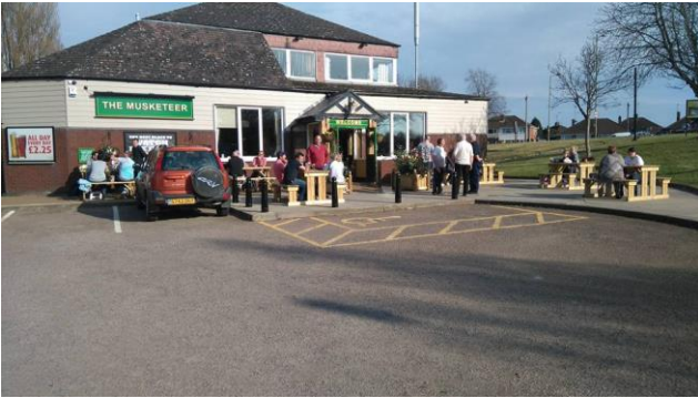
The Musketeer Pub